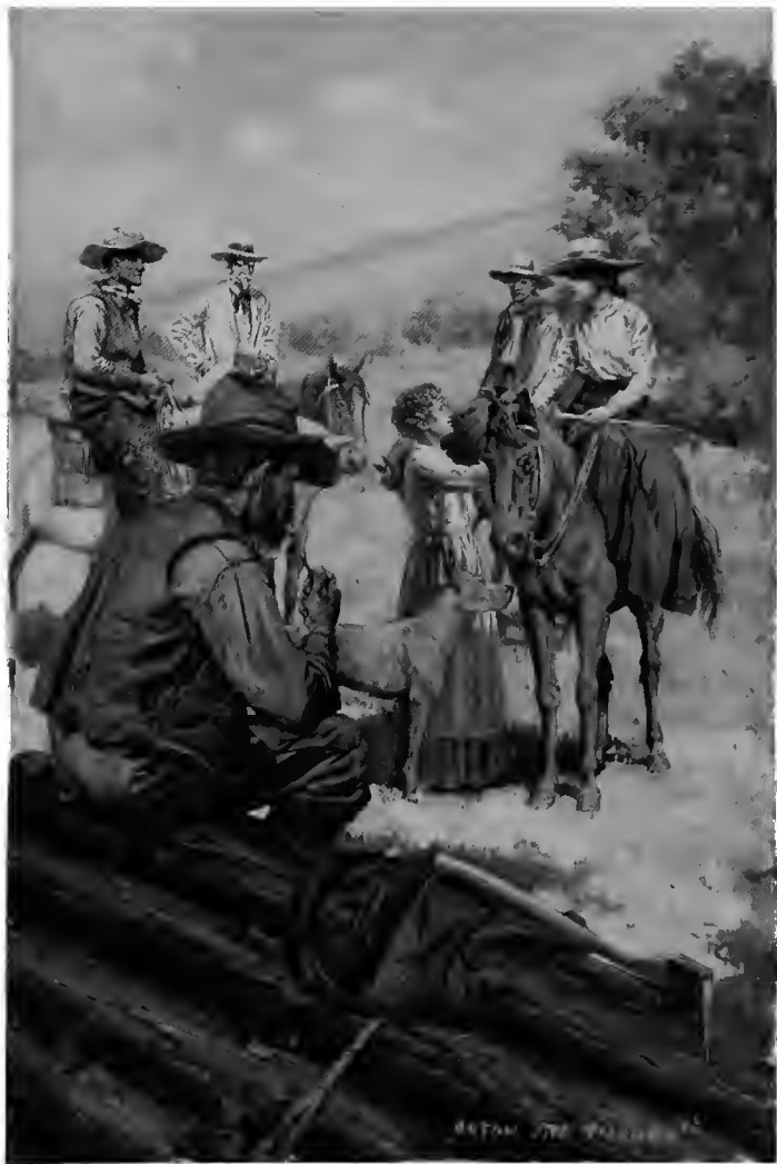
Mrs. Jerry took the señorita's hand and smiled up at her. Page 139.